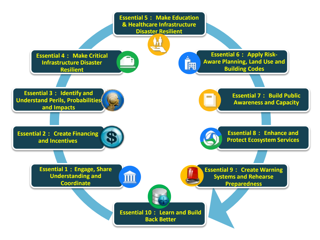
Figure 2.1 Ten Essentials for Building Resilience

The UNISDR 'Ten Essentials' include the critical and interdependent steps local governments may take to make their cities more resilient. Actions under each Essential are part of the overall disaster risk reduction planning process and can influence urban development planning and design.